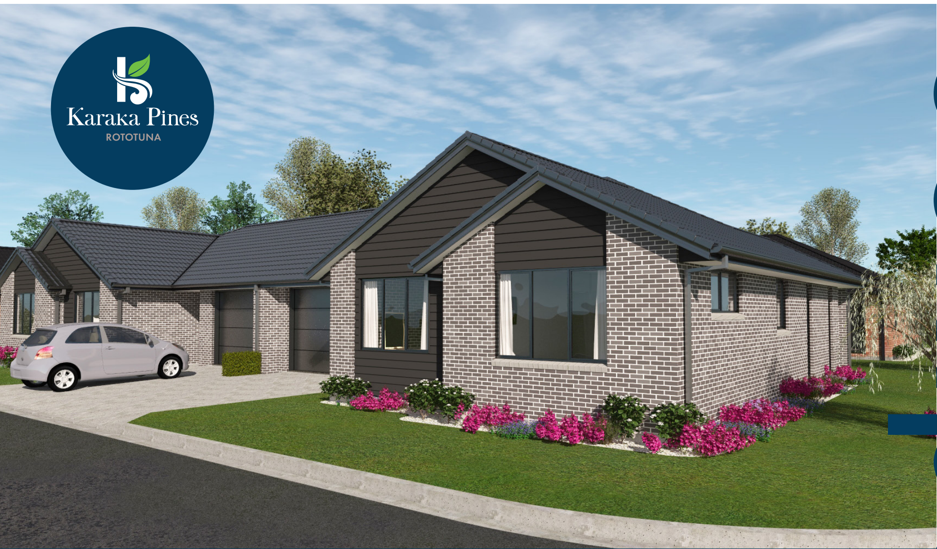
Images are for illustrative purposes only. Final construction design may vary.